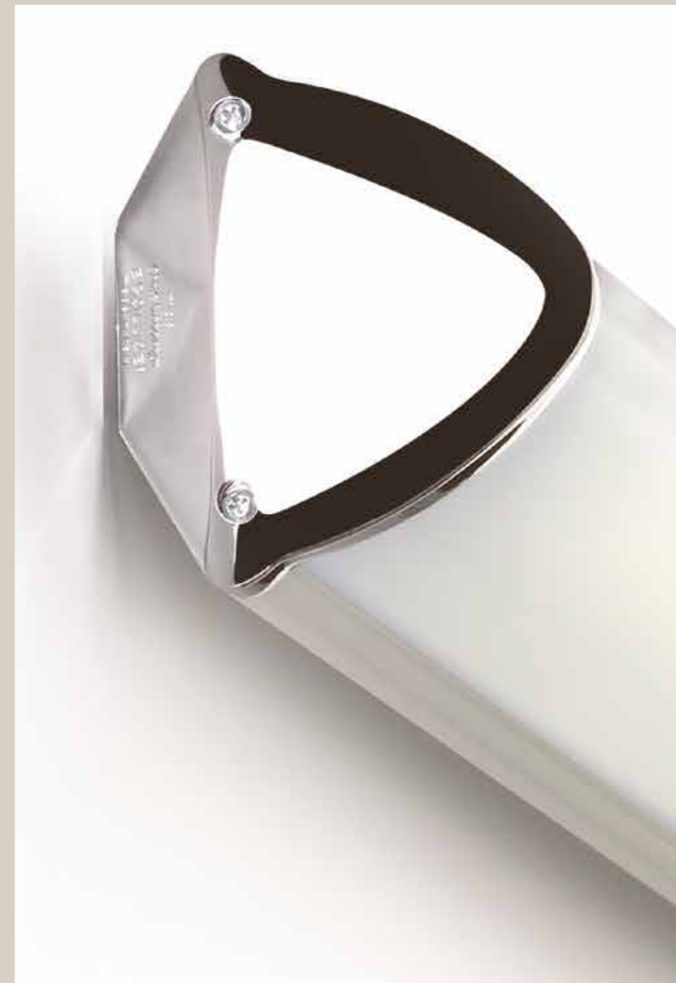
Morning LED design P. Peperè 1997

Настенные или потолочные лампы из алюминия, диффузор из поликарбоната. Кронштейны из хромированного поликарбоната.